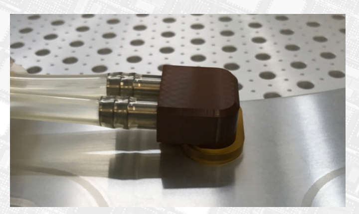
Half Inch Probe with Jig