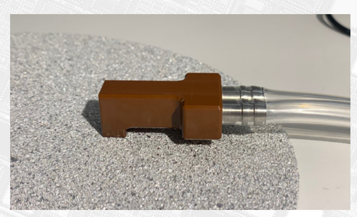
Fin Probe on high roughness surface