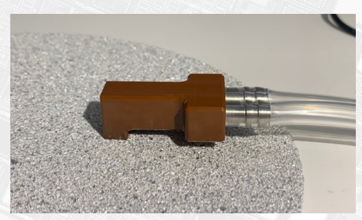
Fin Probe on high roughness surface

STANDARD PROBES: Large array of probes for measuring flat surfaces, inside pipes, gas lines, containers, or edges that are difficult to clean. CUSTOM PROBES: We can design a probe to fit custom surfaces.