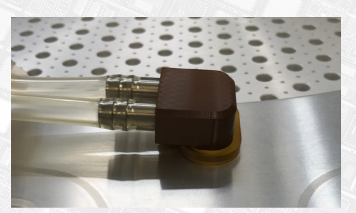
Half Inch Probe with Jig