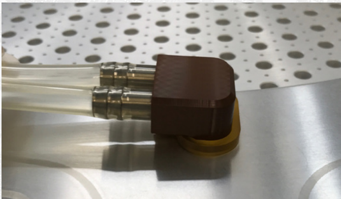
Half Inch Probe with Jig